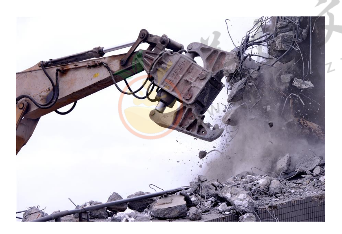
TAINAN, Feb. 10, 2016 (Xinhua) -- Rescuers dismantle Wei Guan Building, which collapsed during a strong earthquake, in Tainan, southeast China's Taiwan, Feb. 10, 2016. The death toll in the collapse of the Wei Guan building has risen to 44 people.

The quake, which the China Earthquake Administration said had a magnitude of 6.7, hit Kaohsiung city at 3:57 a.m. Beijing Time on Saturday, just two days ahead of the Lunar New Year. Local monitoring authorities put the scale of the quake at 6.4.