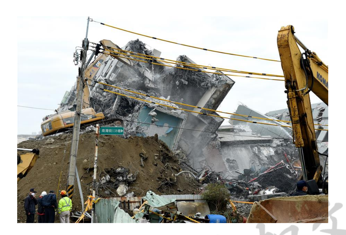
TAINAN, Feb. 10, 2016 (Xinhua) -- Rescuers dismantle Wei Guan Building, which collapsed during a strong earthquake, in Tainan, southeast China's Taiwan, Feb. 10, 2016. The death toll in the collapse of the Wei Guan building has risen to 44 people.