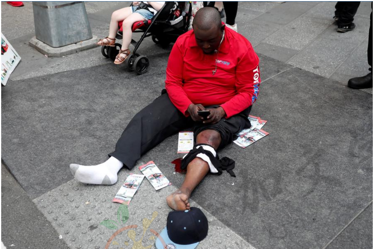
An injured man sits on the sidewalk in Times Square after a speeding vehicle struck pedestrians on the sidewalk in New York City, US, May 18, 2017.

Rojas' burgundy Honda Accord sedan was smoking when it came to a stop on top of a metal stanchion at West 45th Street and Broadway, where it remained at least until 6 pm.